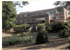
The Moses H. Cone Memorial Hospital