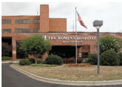
The Women's Hospital of Greensboro