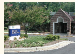
Behavioral Health Center