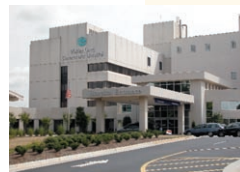
Wesley Long Community Hospital