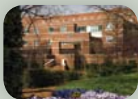
The Moses H. Cone Memorial Hospital

We serve our communities by preventing illness, restoring health and providing comfort, through exceptional people delivering exceptional care.